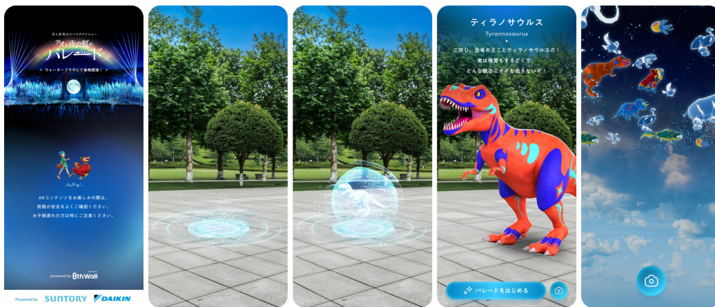
This high-resolution image has been posted on https://www.suntory.com/news/index.html