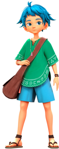
“Ao”, Main character